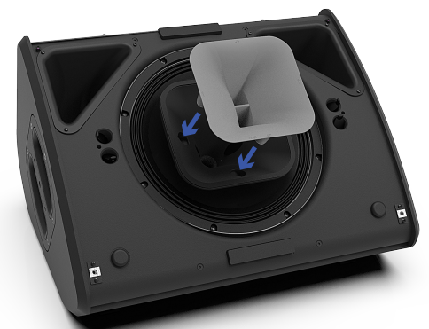
Grille removed, an additional magnetic flange can be quickly fitted to change directivity from 60°x60° to 90°x40°

P12 acoustic phase response is NEXO phase signature allowing inter-operability between all NEXO speakers at all cross-over points, except for the monitor setups where latency is minimized.