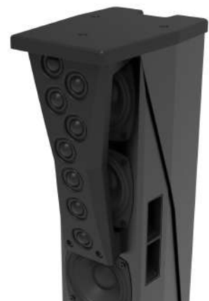
The patent pending HF arrangement coupled with the electronic steering offers +0/-10° or +0/-25° vertical directivity.

The ID84 shares the same phase response as other NEXO speakers, making it extremely easy to mix with all NEXO systems, e.g for side fill or front fill, or when used with any NEXO subs, without risk of comb filtering or requiring complex electronic adjustment.